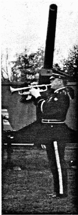
"Taps" U.S. Army Bugler