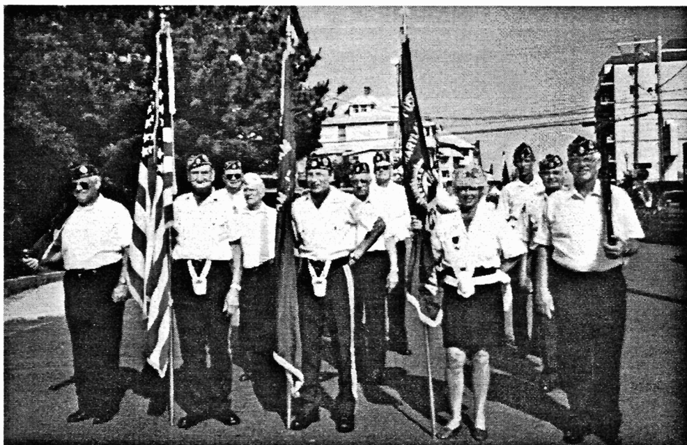
1998 Trophy Winners